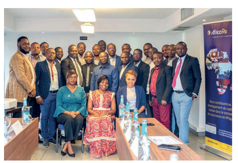
Group photo of participants and facilitators