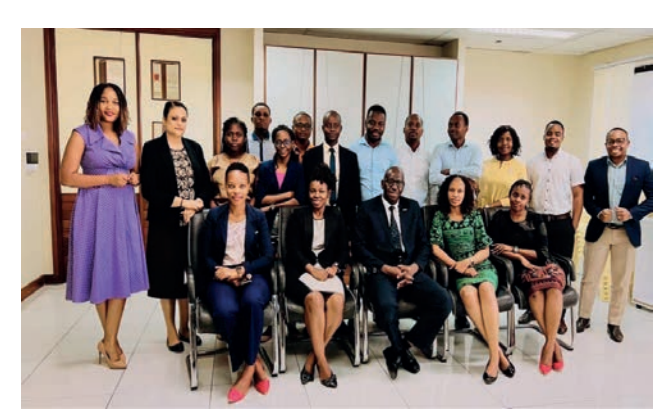
Group photo of participants and facilitators